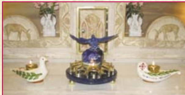
Peace Lamps: «Traditional lamp» and «dove» models