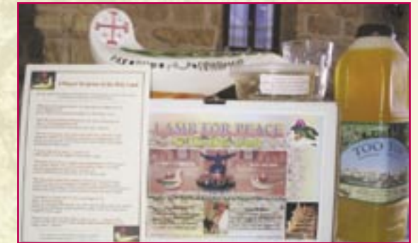
The «Peace Lamp» kit

Despite the villagers' love of their Land, they are inclined to leave, due to the difficulties resulting from the Israeli-Palestinian conflict and the lack of prospects for the future.